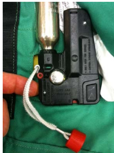
Figure 2. Actuation lever in closed position