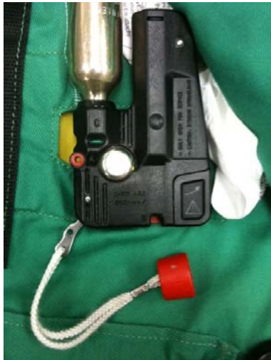
Figure 1. Actuation lever in open position